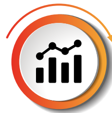
Reporting and Analytics